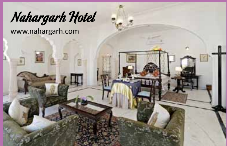
Nahargarh Hotel www.nahargarh.com

A fully escorted tour departing Adelaide on Sunday 17th April 2016 13 nights in India in carefully selected Heritage Hotels