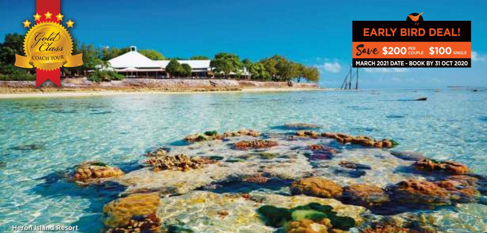
Heron Island Resort

EARLY BIRD DEAL! Save $200 PER COUPLE $100 SINGLE MARCH 2021 DATE - BOOK BY 31 OCT 2020