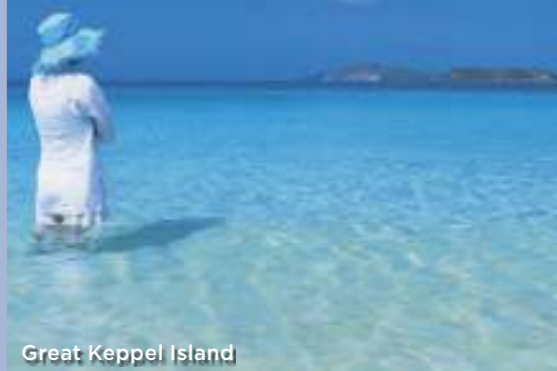
Great Keppel Island