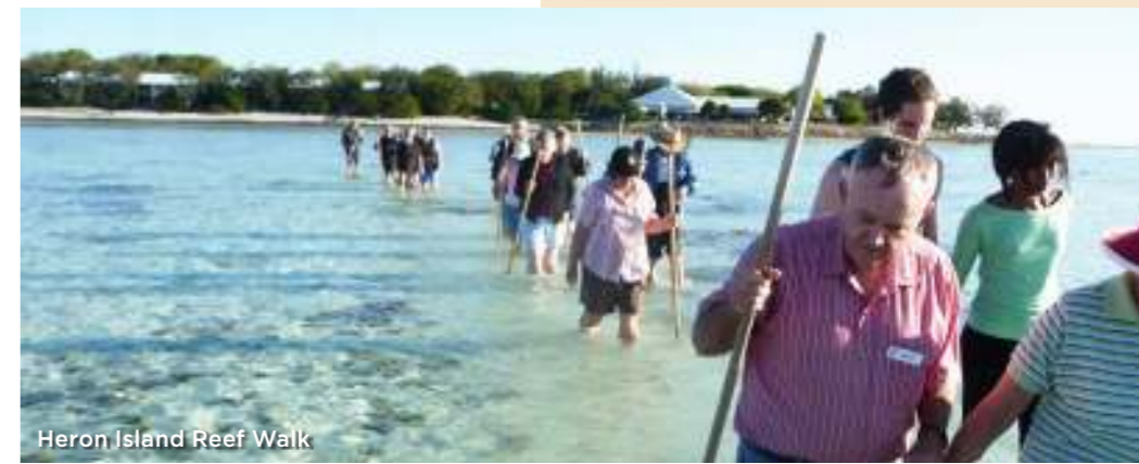
Heron Island Reef Walk

B = Full Breakfast MT = Morning Tea L = Lunch AT = Afternoon Tea D = Two Course Dinner