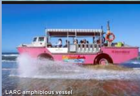
LARC amphibious vessel