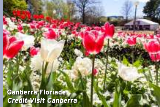
Canberra Floriade