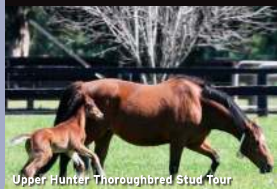
Upper Hunter Thoroughbred Stud Tour