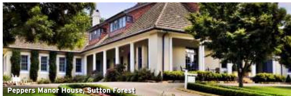
Peppers Manor House, Sutton Forest

2 Night Stay: Hyatt Hotel Canberra ★★★★★