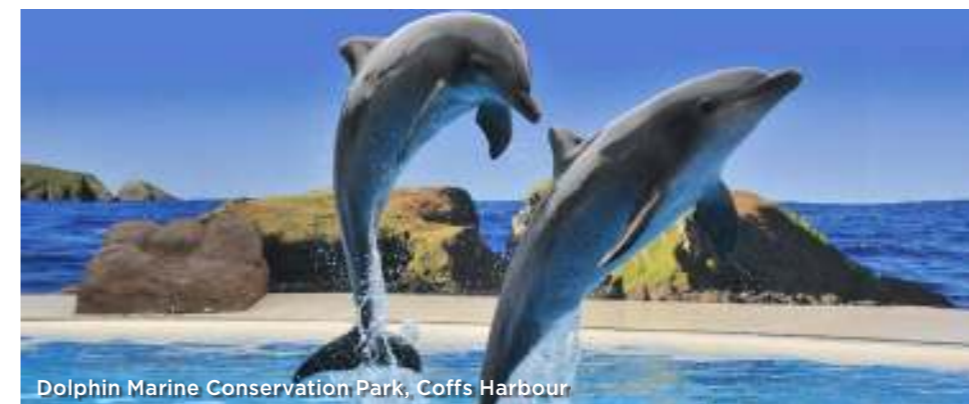
Dolphin Marine Conservation Park, Coffs Harbour