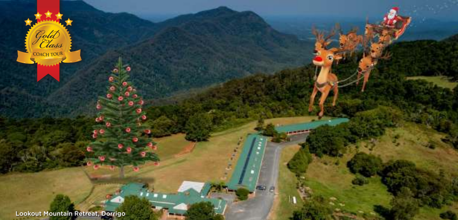
Lookout Mountain Retreat, Dorrigo