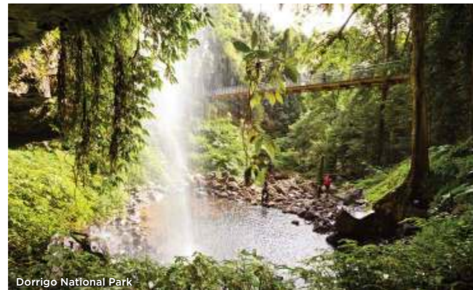
Dorrigo National Park

Saying farewell to the Dorrigo National Park , we travel north along the NSW coast and head for home. We pass through Grafton and break to stretch our legs, and then stop for lunch at Yamba . Enjoy panoramic views of the Pacific Ocean during our break, before departing and making our way back to Brisbane Transit Centre by late afternoon.