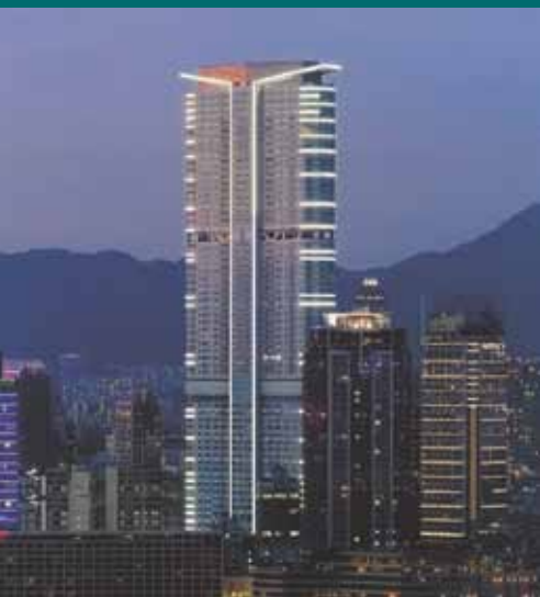
HYATT Regency, Kowloon: