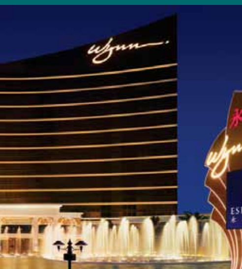
WYNN Hotel & Casino, Macau: