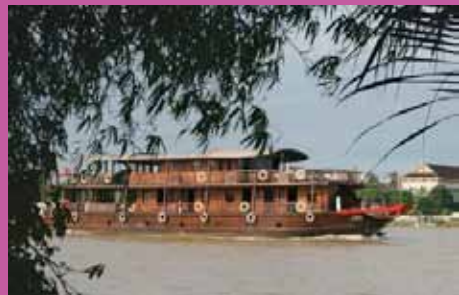
THE BASSAC www.bassacmekongcruise.com