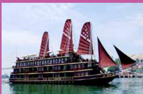
VICTORY STAR www.victorystarcruisehalong.com