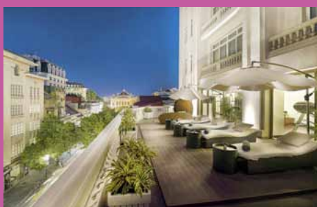
HOTEL DE L'OPERA www.mgallery.com