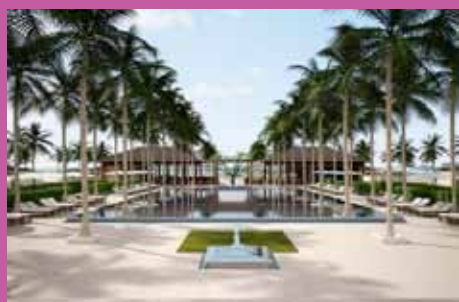
SUNRISE BEACH RESORT HOI AN www.sunrisehoian.vn