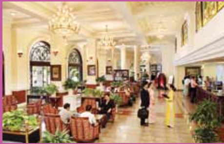
MAJESTIC HOTEL SAIGON www.majesticsaigon.com