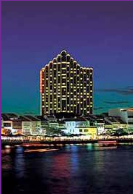
Furama City Centre Hotel